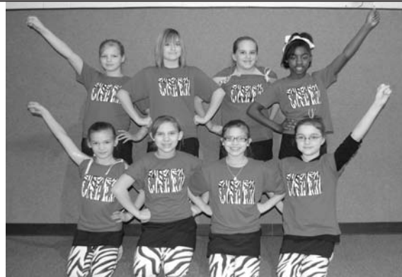
5th-6th Grade Cheerleaders